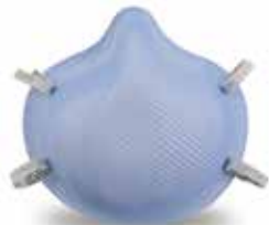
1511 N95 Small