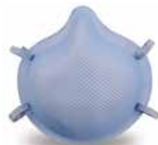
1512 N95 Medium