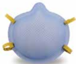
1510 N95 Extra Small