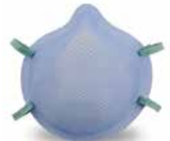
1517 N95 Low Profile Nose