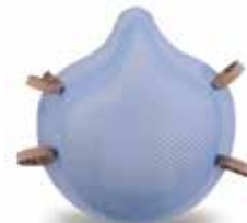
1513 N95 Large