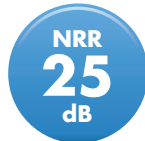
6495 Comets Corded